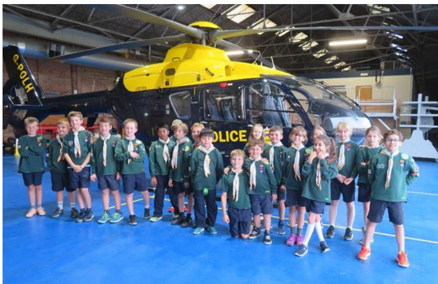
Cubs visiting the Police Helicopter