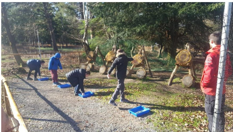
Scouts Throwing Angels at Group Camp