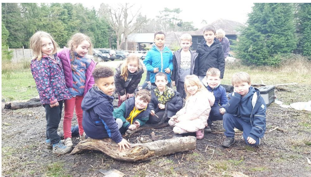
Beavers Learning to Light Fires at Group Camp

Both colonies took part in Group camp, which was the first time that the beavers had been away for a residential experience away from Banstead. All those who attended had a great time, and were able to take part in a range of activities which they would not normally take part in including a low ropes course and tunnelling. You can see some of the photographs from the weekend in the centre of this report.