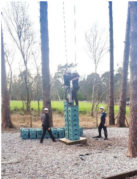
Scouts Crate Staking at Group Camp