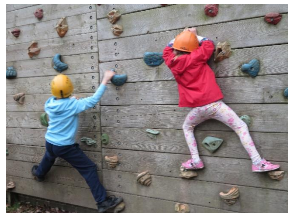
Beavers and Cubs on the Traverse Wall at Group Camp