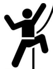
Climbing &amp; Abseiling