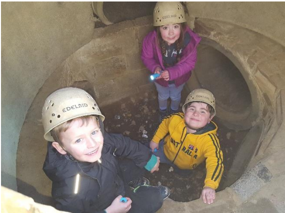
Beavers in the tunnelling complex at Group Camp