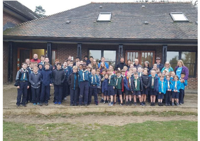
The end of a successful weekend