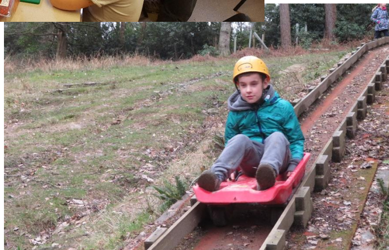
Cubs Sledging at Group Camp