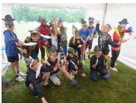
Pirate costumes at cub camp