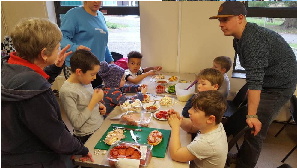
Beavers Making Pitta Pizza for Lunch At Group Camp