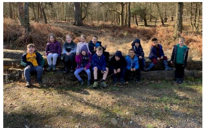
Beavers out on a welly walk at Group Camp