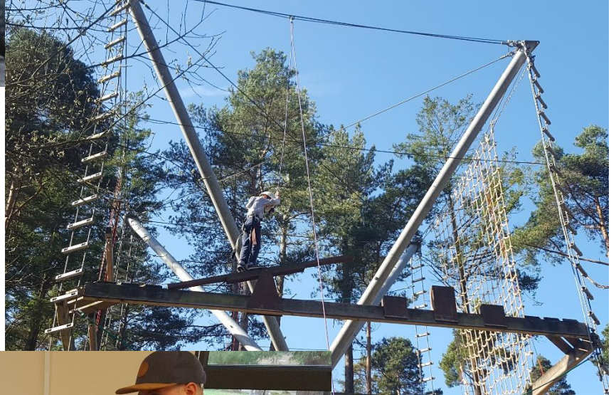
Scouts on High Ropes at Group Camp