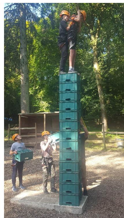
Scouts taking part in a crate staking activity at Downe Campsite

Next year the Scout section will be taking part in Scoutabout 2020, which will bring over 6000 Surrey Scouts and Guides together for a weekend of activities.