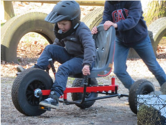
Cubs on Pedal Carts at Group Camp