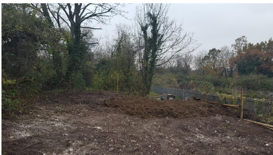
Area cleared at the back of Scout Ridge

Please keep a lookout for the advertised dates which will be sent out by email.