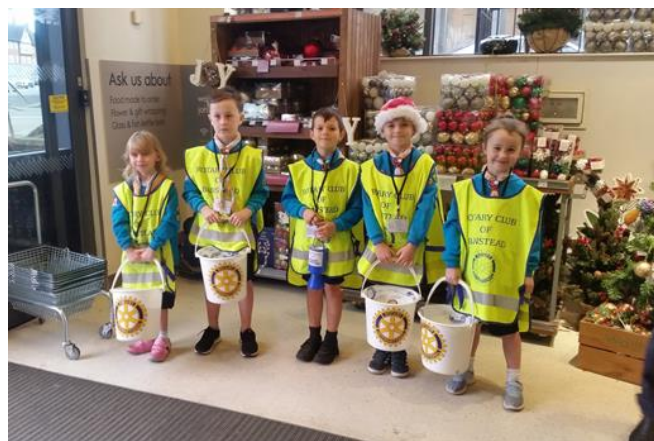
Supporting the Rotary Xmas Collections

Fundraising efforts continue to keep the Group running but particularly to replace the Groups minibus. We are well on our way to meeting our minibus target with grants from the Lottery Fund, Surrey County Council, and local Freemasons and Rotary Clubs. We do need a final push to reach our target so please look out for the dates of the Santa collections in December and other fundraising opportunities coming up soon and get involved.