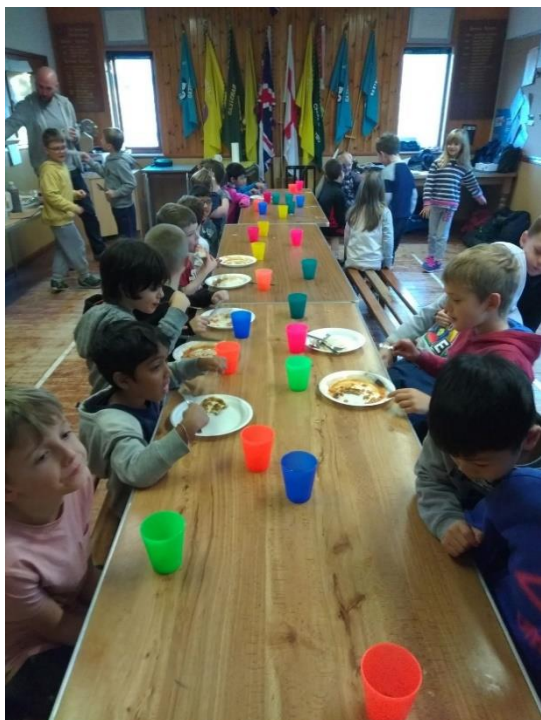
Beavers Enjoying a Sleepover Meal