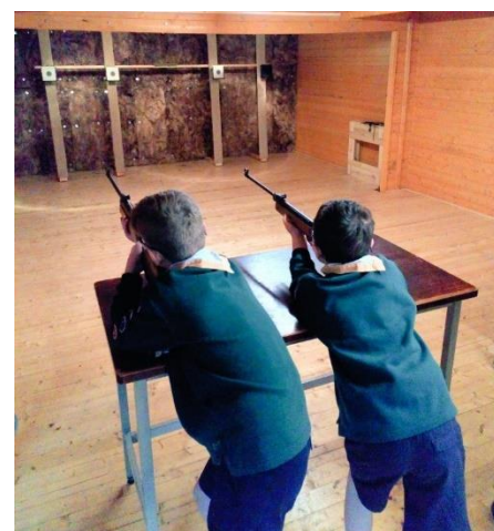
Cubs Taking Part in District Shooting Competition

The Cubs are planning to return to Brambletye, near East Grinstead for their annual summer camp. The Cubs sleep in traditional ridge tents, and have all their meals cooked by the leadership team on open wood fires. The Cubs take part in a wide range of activities during the camp including backwoods cooking, and an opportunity to complete their swimming badges using the school pool.