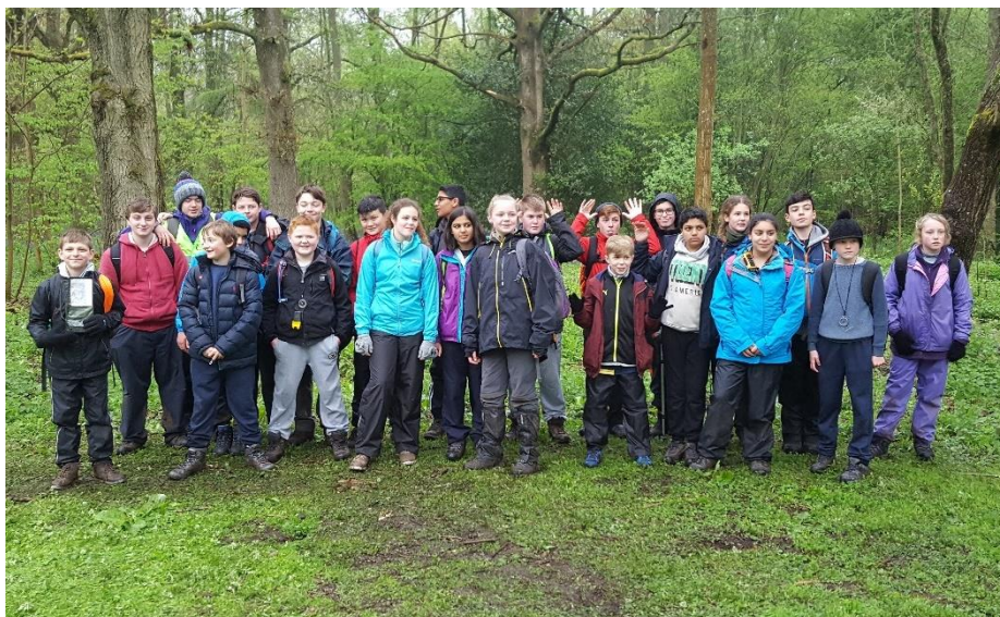
Scouts on North Downs Way Expedition Challenge 2018