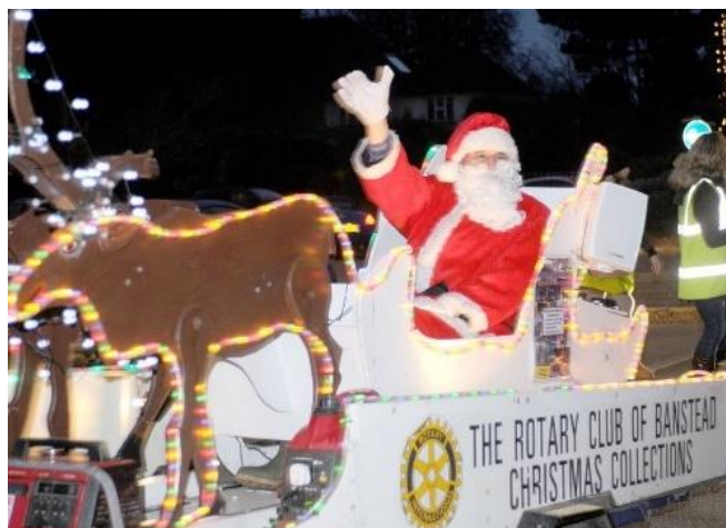
Supporting the Rotary Xmas Collections

If you would be interested in helping the Executive, please get in touch by email membership@3rdbanstead.co.uk