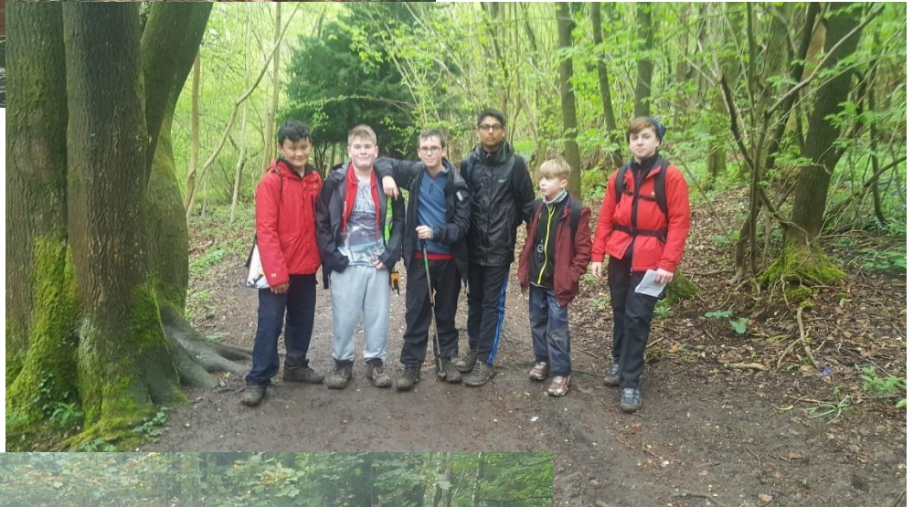
Scouts Hiking the North Downs Way