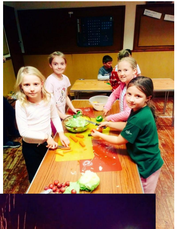
Lots of Fun at the Cub Sleepover