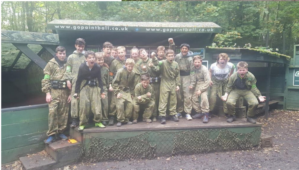
Scouts making War Faces at Paintball