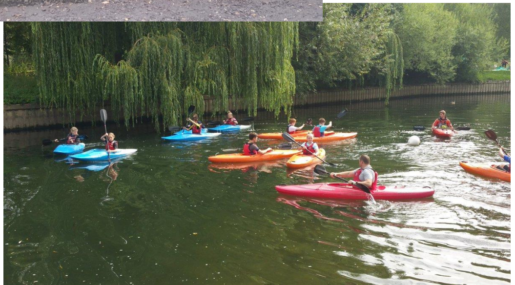
Scouts Kayaking at Longridge