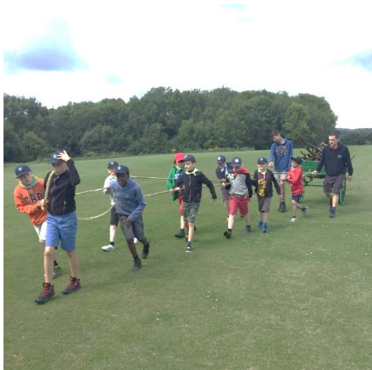
Collecting Fire Wood at Cub Camp