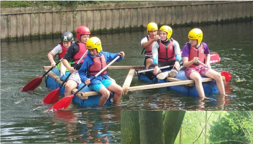
Scout Raft Building at Longridge