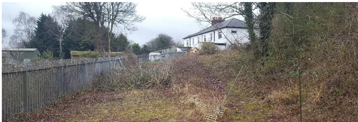
Cleared Area at Back of Scout Ridge

In September last year, we launched our project to re-purpose the land at the back of Scout Ridge. The area had become largely overgrown, and accounted for approximately 50% of the green space available at Scout Ridge.