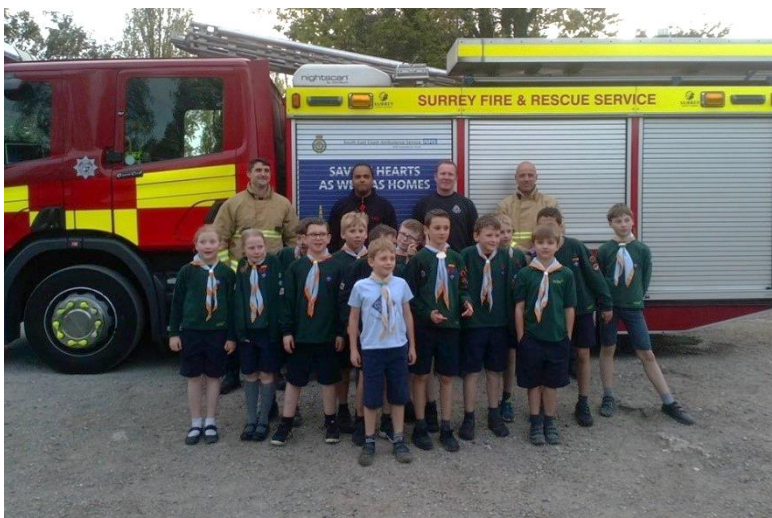
A visit from the Fire Brigade for the Cubs