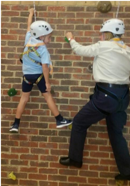
Beaver Investiture on the Climbing Wall at Scout Ridge