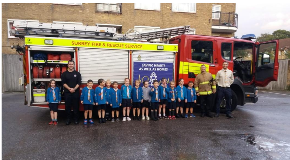
Beavers from Ontario Colony at Epsom Fire Station