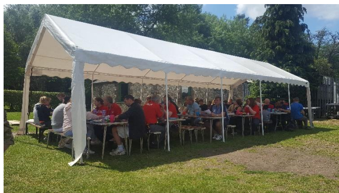
Mealtime at Family Camp 2018

This year we will be holding a Family Camp at our District Campsite Park Farm over the weekend 6-7 June, with the option of also staying on the Friday night. Family Camp is an opportunity to get the whole family involved in the Scouting experience including parents, siblings and extended family.