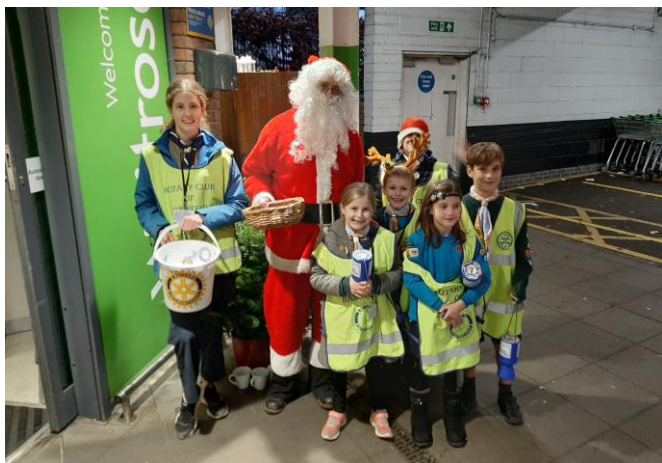
Xmas Collections 2019

Our Executive Committee are Trustees responsible for funds and assets of the Group.