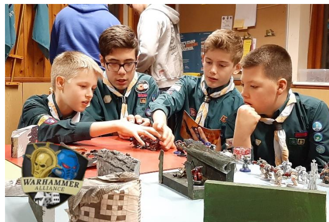
Scouts Complete War Hammer Model Building

The Scouts spent part of the term completing their model maker activity badge, by building Warhammer miniatures, using free resources we received from Games Workshop. After building the models, the Troops took part in a games evening using the models they had built.