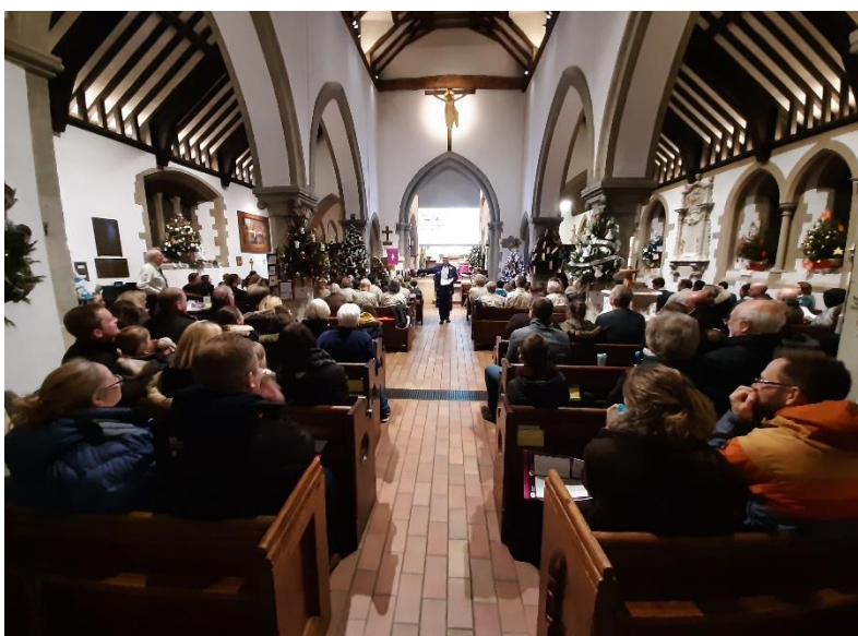
Members and Families Awaiting the Start of the Carol Service

The same weekend, the Cubs enjoyed a Remembrance weekend sleepover, where they made poppies to wear on their uniform.