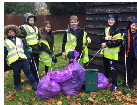
Cubs Getting Ready for Litter Picking

Both Packs attended their annual Remembrance weekend sleepover at Scout Ridge. The cubs took part in activities including climbing, abseiling and cooking. The Cubs also braved the wet weather to carry out litter picking around the local area.