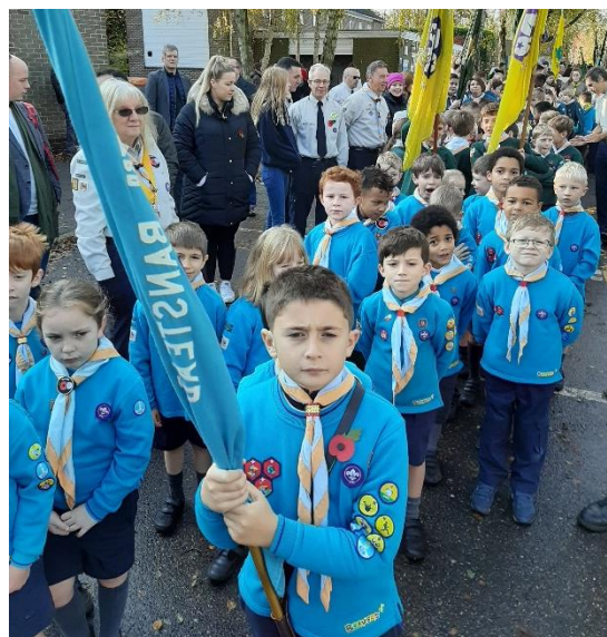
Beavers on Parade at Remembrance Day Parade